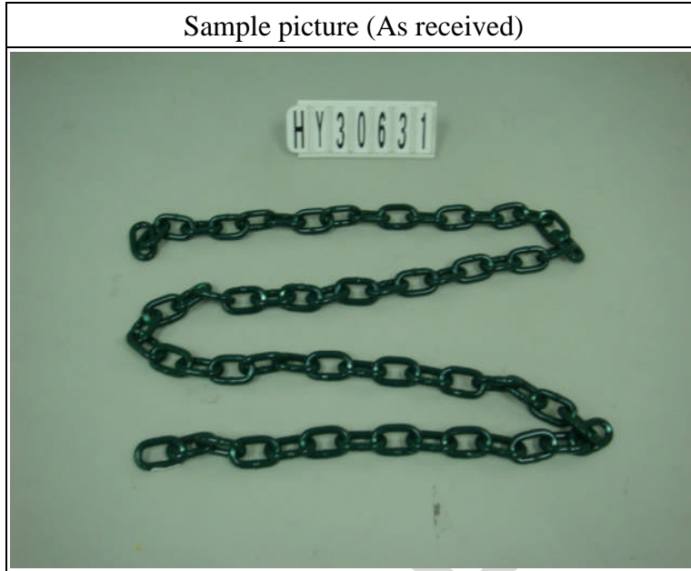
Sample picture (As received)