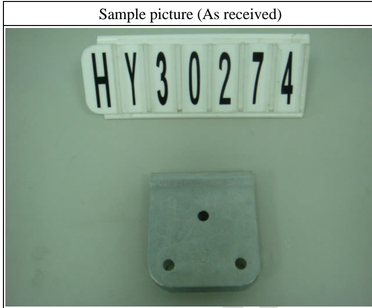
Sample picture (As received)